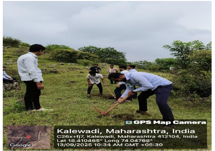
GPS Map Camera Kalewadi, Maharashtra, India C26x+fj7, Kalewadi, Maharashtra 412104, India Lat 18.410465° Long 74.04788° 13/09/2025 10:34 AM GMT +05:30

Demintim PROGRAMME OFFICER NATIONAL SERVICE SCHEME PUNE DISTRICT EDUCATION ASSOCIATION'S SETH GOVIND RAGHUNATH SABLE COLLEGE OF PHARMACY, SASWAD