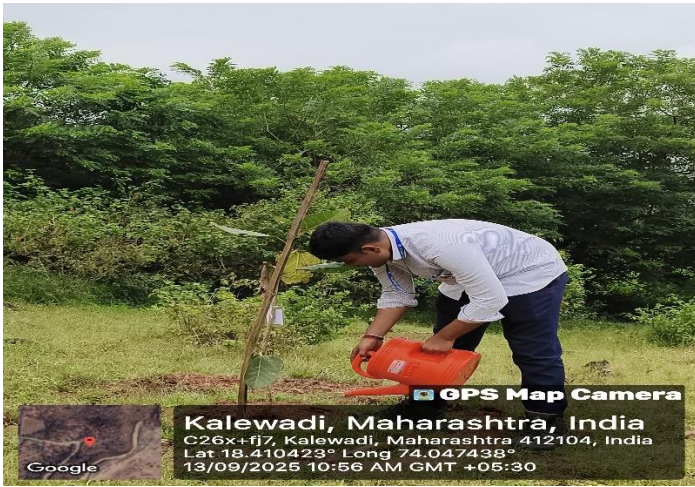
GPS Map Camera Kalewadi, Maharashtra, India C26x+fj7, Kalewadi, Maharashtra 412104, India Lat 18.410423° Long 74.047438° 13/09/2025 10:56 AM GMT +05:30