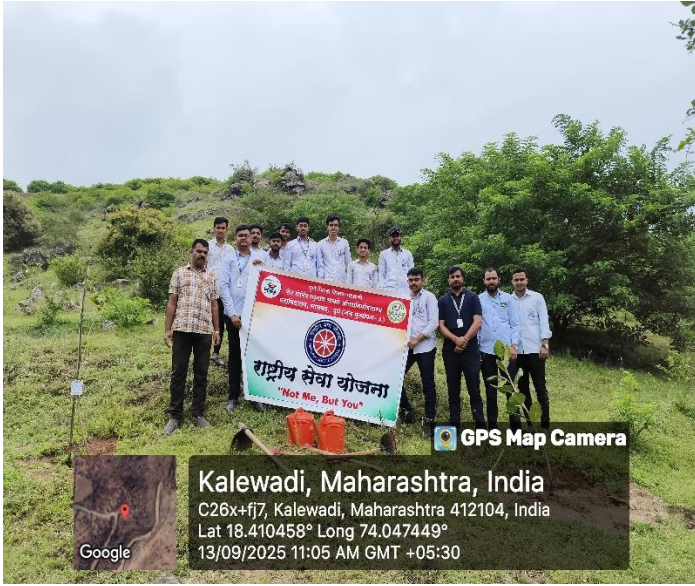
GPS Map Camera Kalewadi, Maharashtra, India C26x+fj7, Kalewadi, Maharashtra 412104, India Lat 18.410458° Long 74.047449° 13/09/2025 11:05 AM GMT +05:30