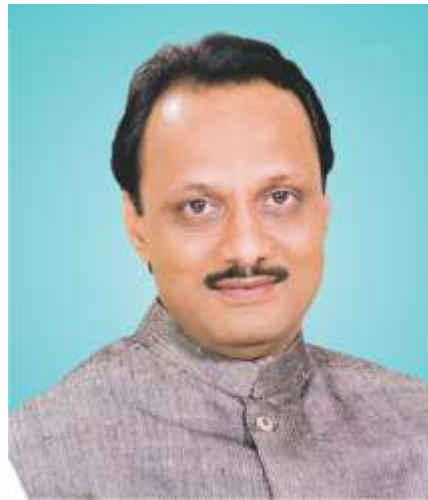
Hon. Ajit Pawar President