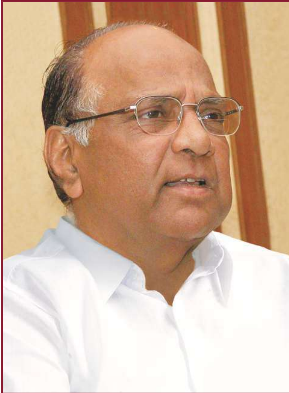
Padmavibhushan Hon'ble Sharadchandraji Pawar